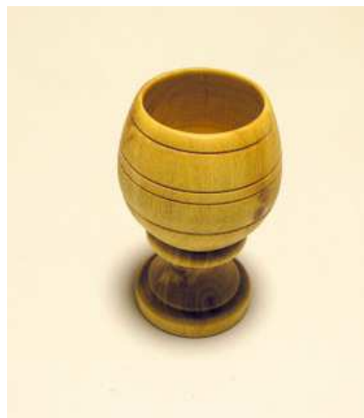
Small piñon goblet—Bob Fain