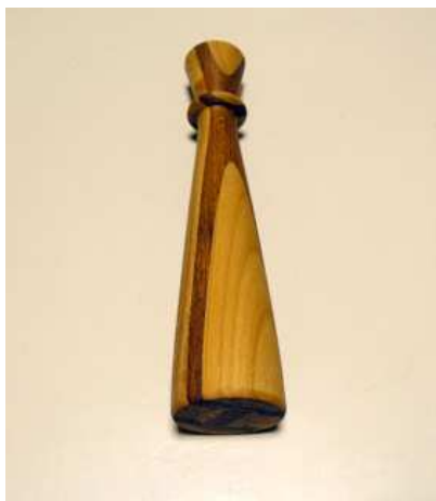
Candle holder—Steve Van