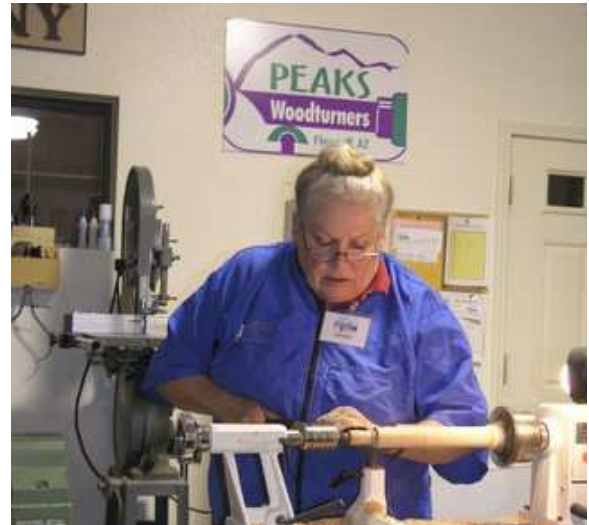
Lin creates a tenon for the ferrule