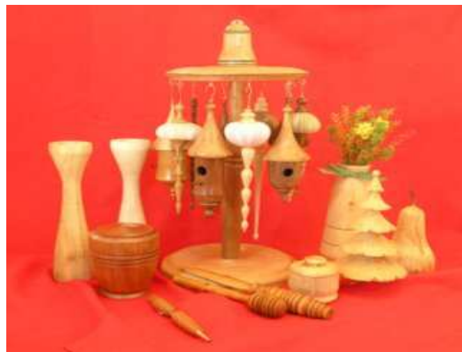
A little bit from everyone for the library display