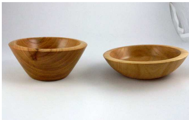
Small cherry bowls—Jeanette Baker