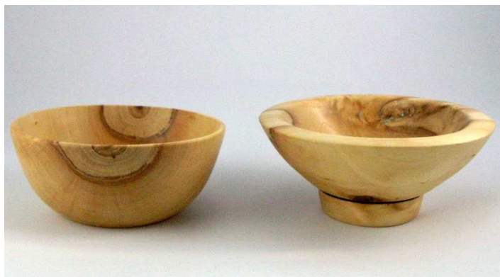
Small piñon pine bowls—Jeanette Baker