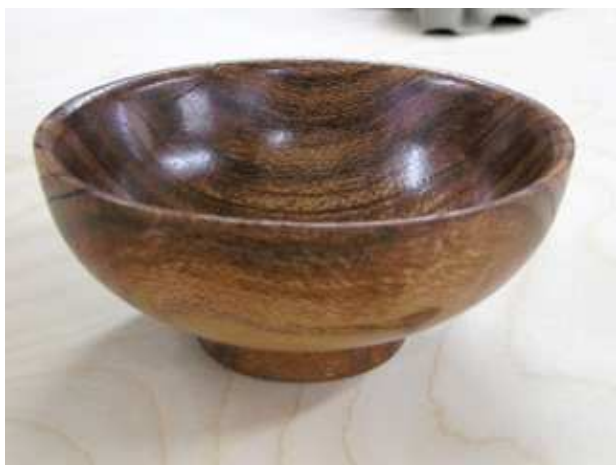
Silky oak bowl—Jeanette Baker