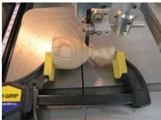
Cutting the scoop on the bandsaw