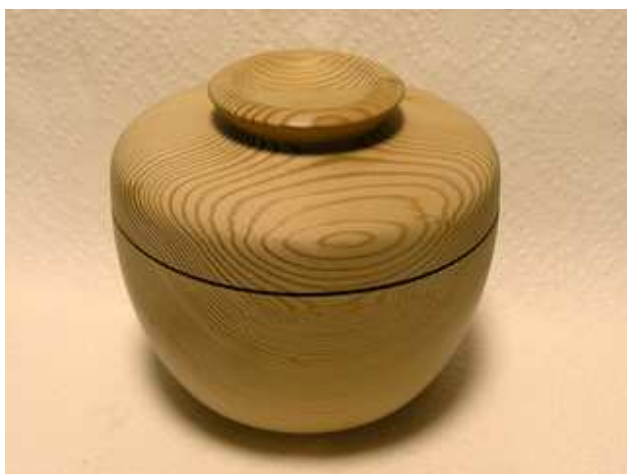
Old growth pine box—Steve Van