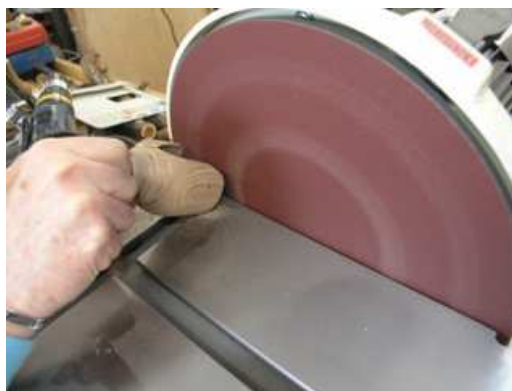
Rounding the scoop edge

SEE THE MAP AND INSTRUCTIONS ON HOW TO GET TO STEVE VAN'S ON PAGE 5 >>