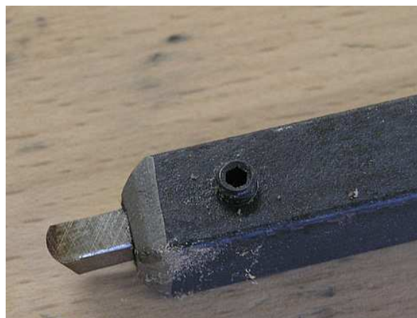
Business end of the tool