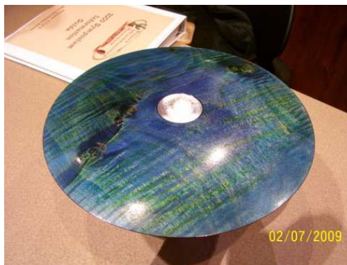
A beautiful Jimmy Clewes turning