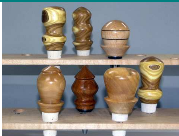
Jeanette Baker—bottle stoppers