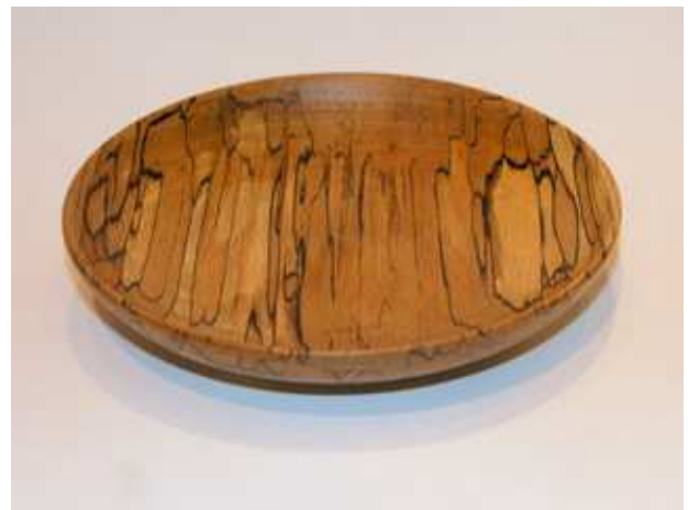
Lin Kwis — Spalted Platter