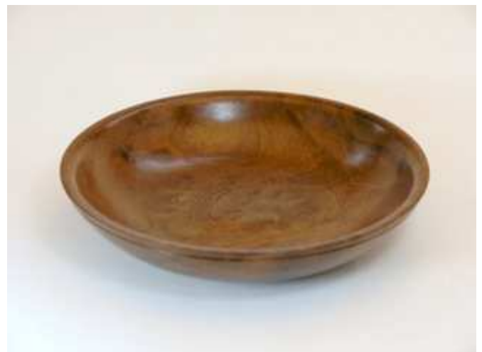
Don Baker—Shallow claro walnut bowl